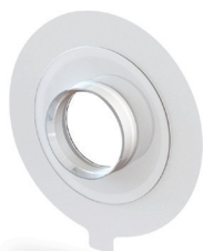
Round BE 6082