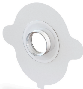
Oval Extra BE 6084