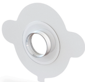
Oval BE 6083